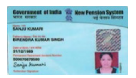
PRAN card issued to customers post registration

Subscription to the Swavalamban scheme in Bihar according to figures received from the PFRDA currently stands at 16,202. This number is increasingly on the rise. Considering that the scheme is still in its initial year the are some glitches that are being faced by the aggregators, the regulators as well as the subscribers.