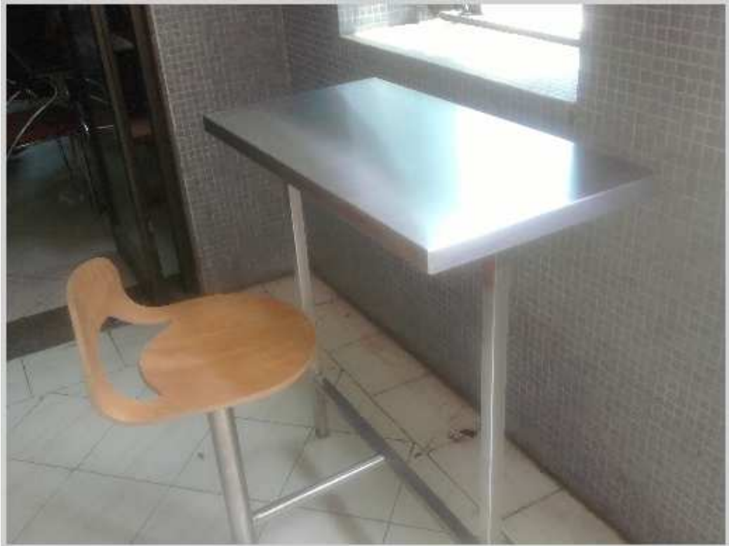
SAMPLE PHOTO GRAPH